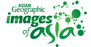
PHOTO COMPETITION LIVE JUDGING & WORKSHOPS Organised by ASIAN Geographic , Asia's leading geographic title and a source of inspiration for professional photographers, photography enthusiasts and avid travellers, enter your best images to be considered for the following coveted titles: • People Photographer of the Year • Street Photographer of the Year • Architecture/Landscape Photographer of the Year • Wildlife Photographer of the Year • Black + White Photographer of the Year • Young Photographer of the Year

Visit www.asiangeo.com/hot-soup-school-challenge for more information